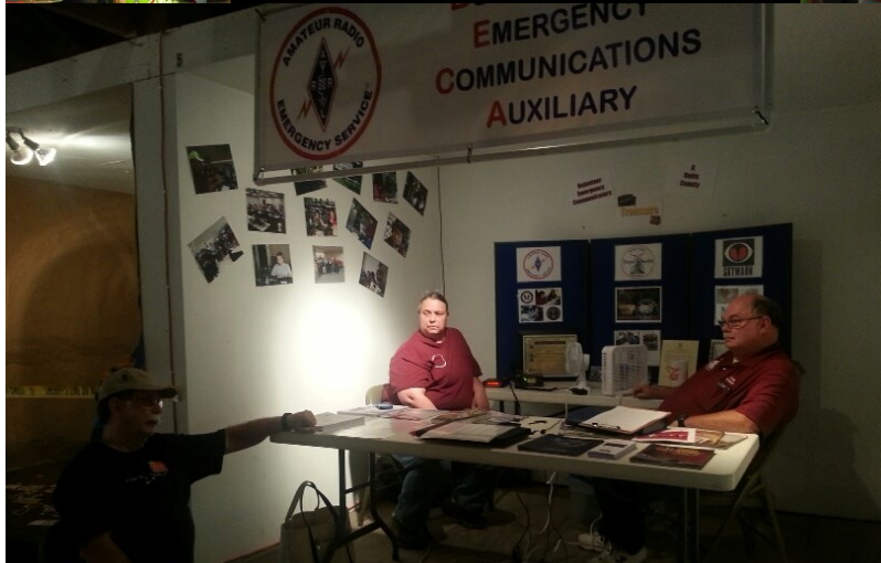
Thanks to all who helped build and staff the Booth each night of the fair.

SET and Special Event Station at Jenkinsburg City Park October 25