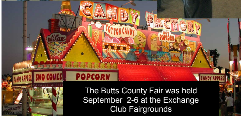
The Butts County Fair was held September 2-6 at the Exchange Club Fairgrounds