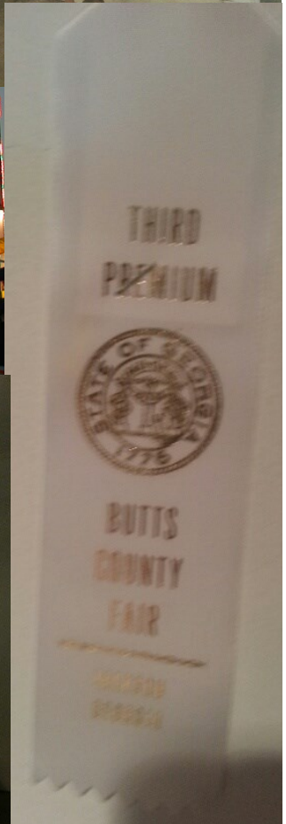
We won 3rd place for our booth!